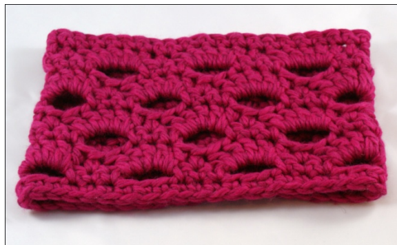
Finished Product Sewn and laying flat

CH: chain; SC: single crochet; DC: double crochet; ST(S): stitch(es)